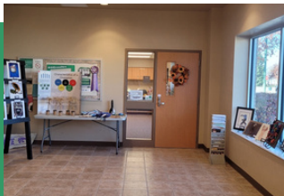
St John Office

Stafford County Extension Office: 210 E. 3rd Ave, St John, KS 67576, Ph: 620-549-3502